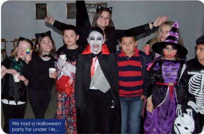
We had a Halloween party for under 14s...

collage; performance and animation to enhance creative skills, knowledge of technology, confidence and understanding of the local neighbourhood.