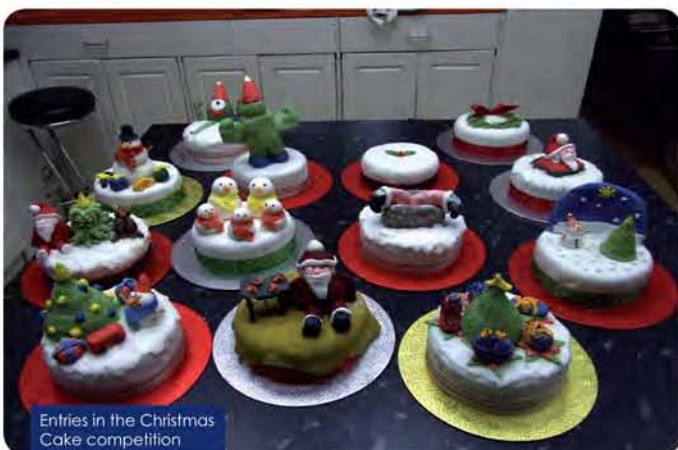
Entries in the Christmas Cake competition