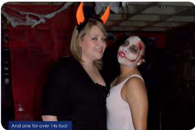
And one for over 14s too!

A record-breaking 200 members attended our Halloween Party back in October. The Youth Work team transformed every room in the Club into a scary space where members played spookily themed games, ate devilish delights and danced the night away. Huge efforts were made with fancy dress and much fun was had by all!